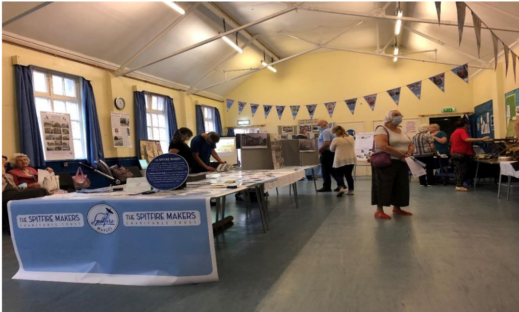
The Journey to Peace exhibition

As a project we also seek to reveal the wider role played by women during WW11; it is documented that at this site, the former Rechabite Hall, now Shirley Parish Hall, 60 out of the 70 Spitfire Making staff were women. It was a fitting location for such an exhibition and well received by the local community. Reports of the event can be found on our website and social media.