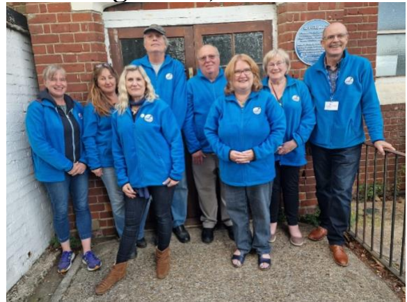
Spitfire Makers wearing new matching Team fleeces at the 18 th September 2022 Shirley Heritage Open Day thanks to the SCC Community Chest grant.