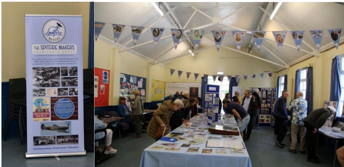
Pull up Display and Spitfire Makers Bunting Funded by the SCC Community Chest Grant used in the Exhibition at Shirley Parish Hall (and taken to subsequent public talks).