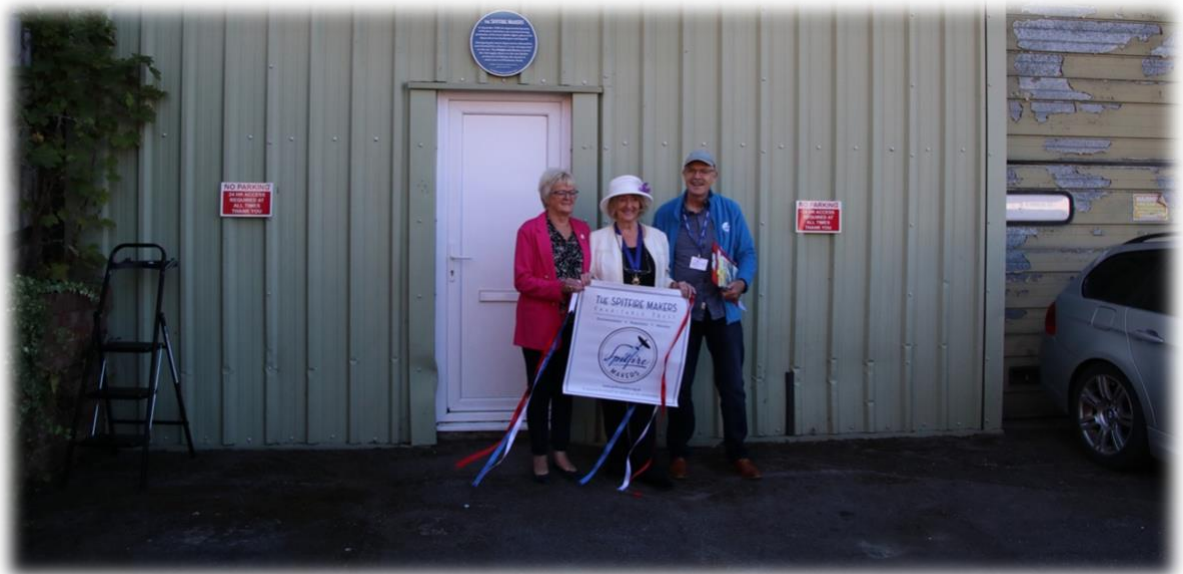
Hollybrook Stores Plaque Unveiling (September 2022)