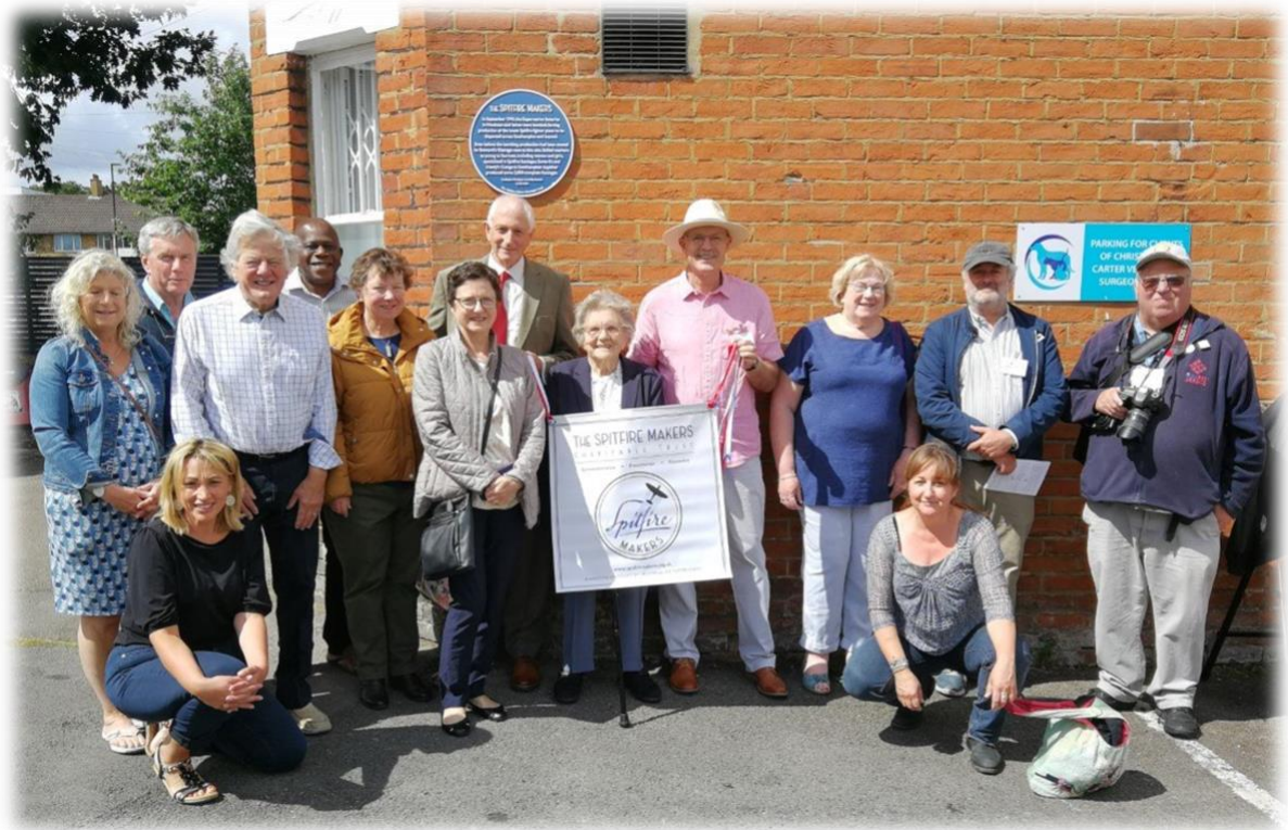
Sewards Garage Plaque Unveiling (June 2022)

Since the first of our Spitfire Makers plaques was unveiled in March 2022, we have placed another 3 in the past year. Plaques have been sponsored by individuals and heritage groups and we have received pledges of support for further plaques from individuals, schools and businesses.