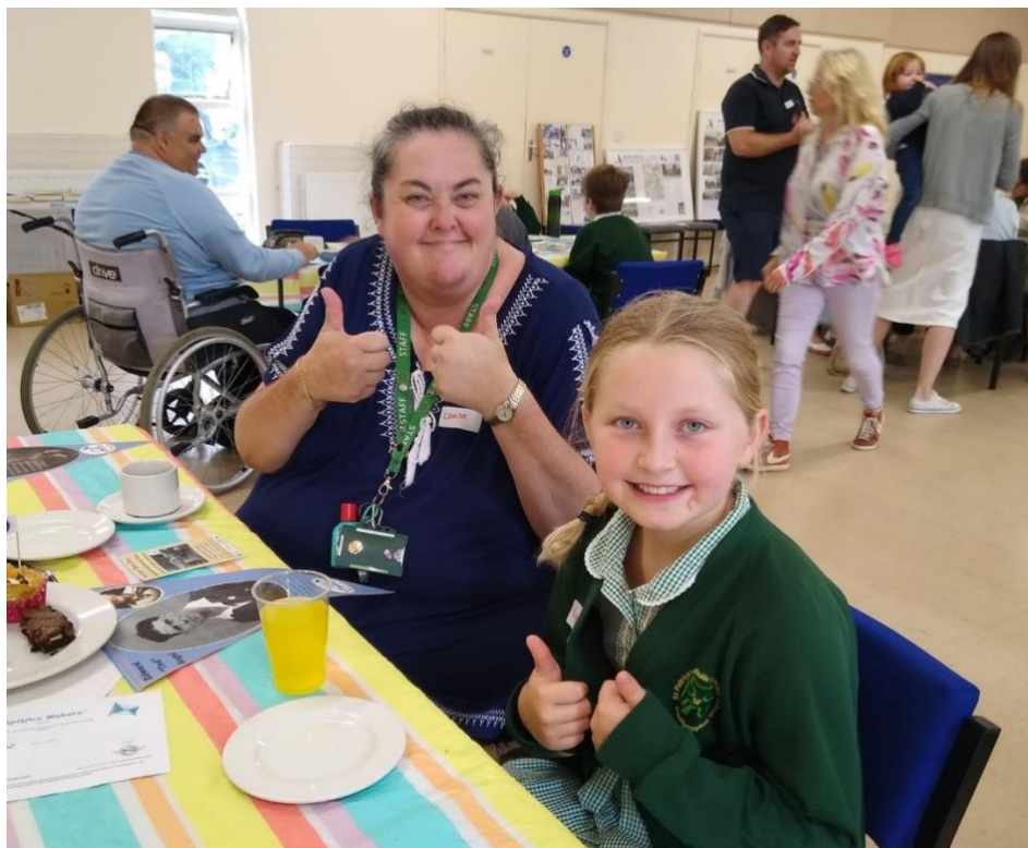
All ages learning about Spitfire Makers, using the pennants, at the Woolston Friendship Club