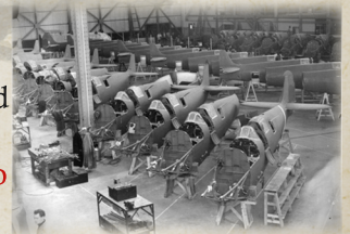
Spitfire fuselages inside the Itchen Works