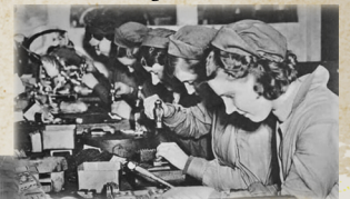
Women working at Woolston Works