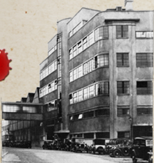
Entrance to Woolston Works